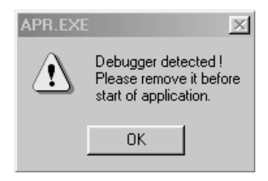
Figure 7.1: ASProtect has just found an active debugger

Your program should perform a simple test for the presence of a debugger in memory as soon as it starts. If a debugger is found, the program should refuse to run and possibly display a warning that the debugger should be removed (see Figure 7.1). While a cracker will probably be able to get around the first test easily, you should consider having the program, in a later test, check a second time for the presence of a debugger. Then, if it finds that a debugger is still active, the program could "freeze," or do something else to make it difficult or impossible for the cracker to continue. I do not, however,